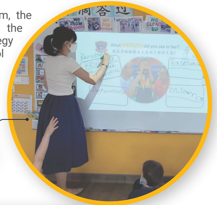
A Virtues Project lesson in progress

For example, in Invictus @ Centrium, the Virtues Language, an essence of the Virtues Project, remains a key strategy to nurture virtues among the school community. Apart from virtues lessons, 'I See a Virtue in You', being a key initiative, creates the platform for the school community to use the Virtues language.