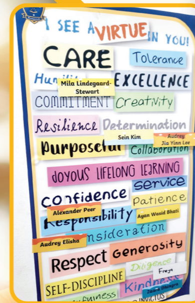
'I See a Virtue in You' Poster in every classroom